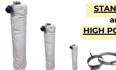
Magnesium Anodes (17#,9#,1#) Custom Sizes Available