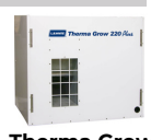
Therma Grow Greenhouse Unit (120k-220k)