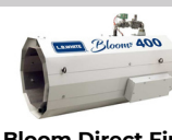
Bloom Direct Fired Greenhouse Unit (400k)