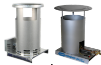
Workman/Norseman Convection Heater (100k-250k)