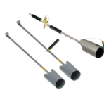
Propane Torches (300k-500k)