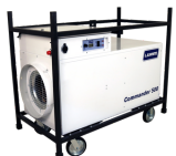
Commander Make-up Air Unit (500k-2.3M)